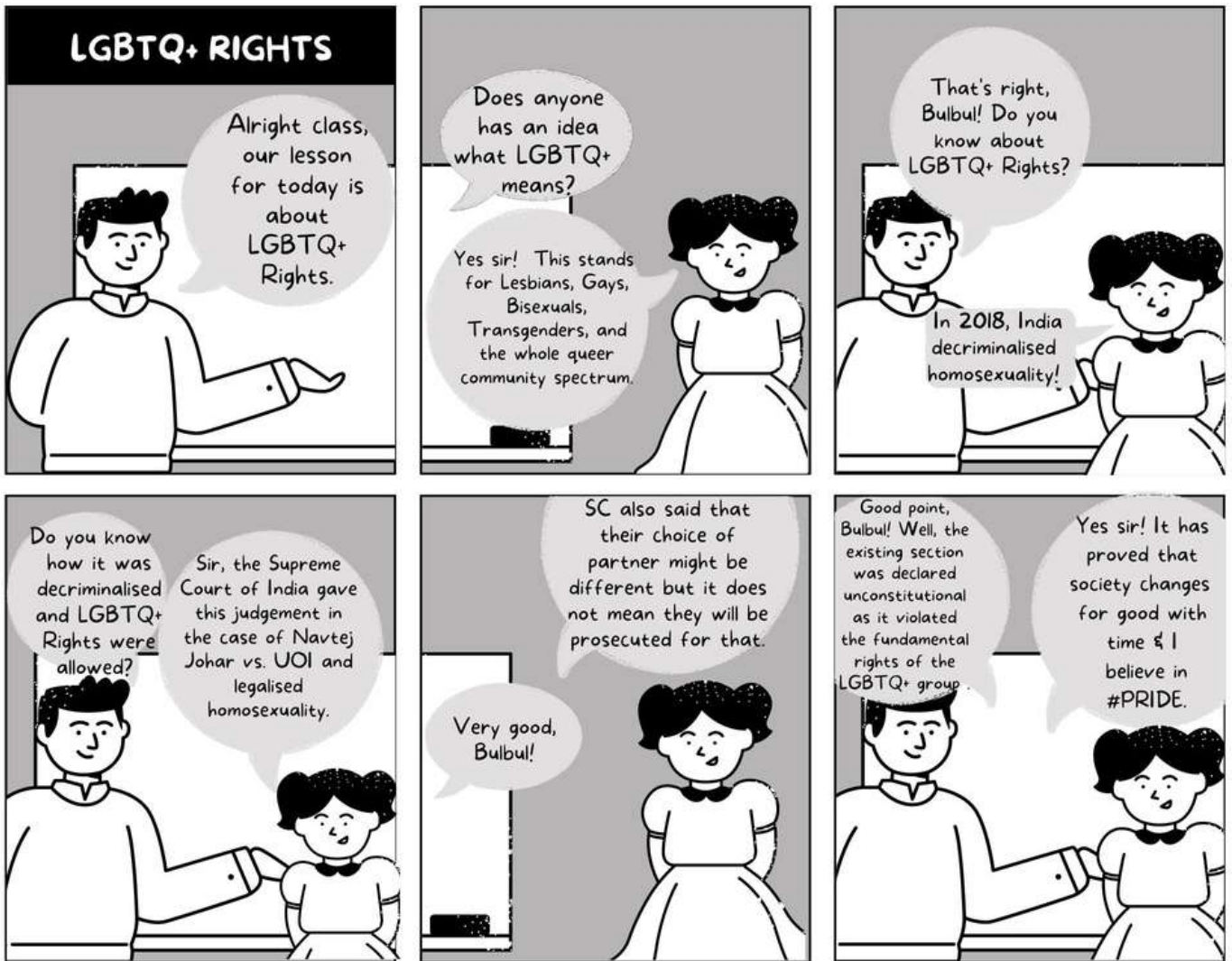
Illustration By Kunal Gupta

Under the Nyaya Bandhu Programme, Department of Justice, Ministry of Law & Justice, Government of India