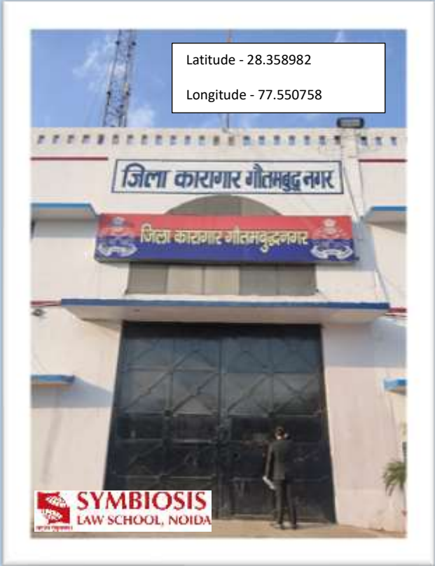
Gautam Buddha Nagar District Jail – Jail Visit