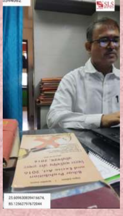
Page 4 of 4