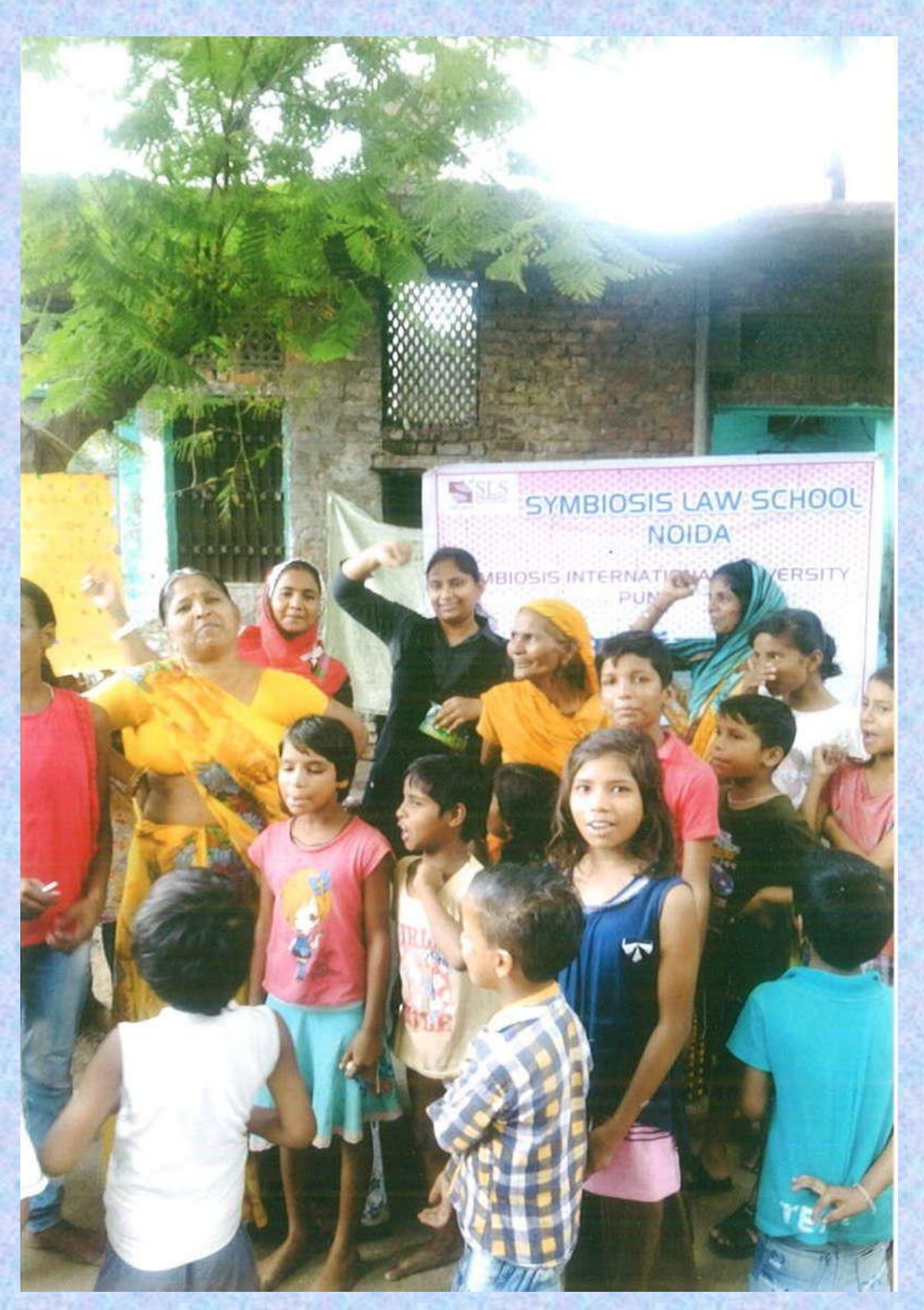
Page 11 of 13