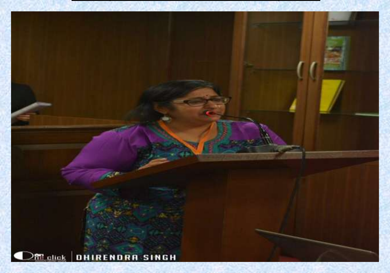
Team from N.U.J.S., West Bengal